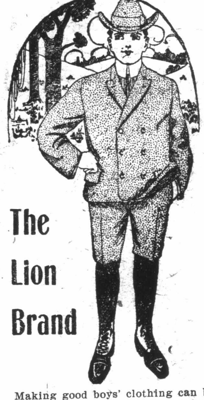
The Lion Brand

Made with double seats, double knees and double elbows