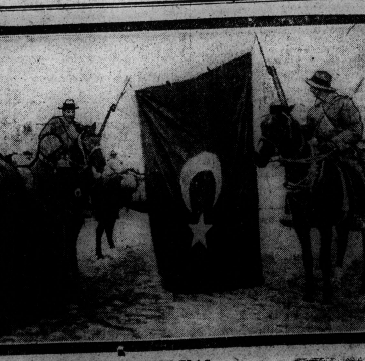
A CAPTURED TURKISH FLAG. Anzacs captured a Turkish flag in a successful attack upon the enemy near Gaza.

Unimpeachable—if you were to see the unequalled volume of unimpeachable testimony in favor of Hood's Sarsaparilla, you would upbraid yourself for so long delay in taking this effective medicine for that blood disease from which you are suffering.