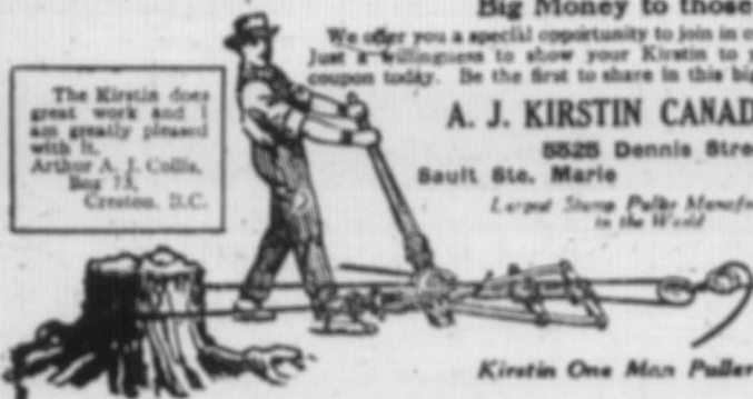
Kirstin One Man Puller