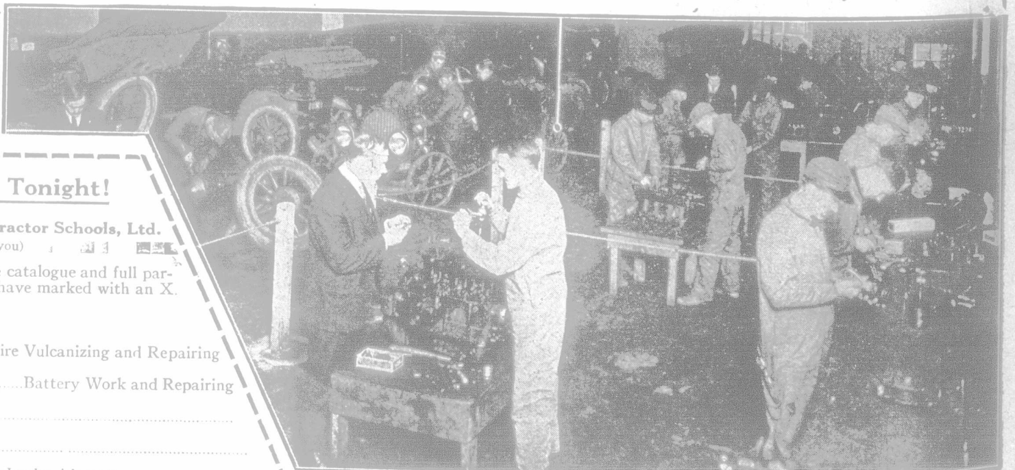
Students doing actual work on all makes of Automobiles and Tractors.

Branches at Winnipeg, Regina, Saskatoon, Edmonton, Calgary, Vancouver, Victoria, and many cities in the U. S. A.