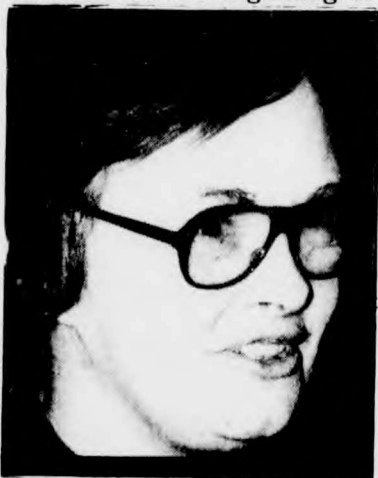
Author Marian Engel.

Engel, justifiably, is concerned with the commercial success of her novels. Lunatic Villas has sold only 2,400 copies and consequently Engel said, she cannot earn a living wage by writing. She voices the pessimism of many Canadian writers. "We are beginning to