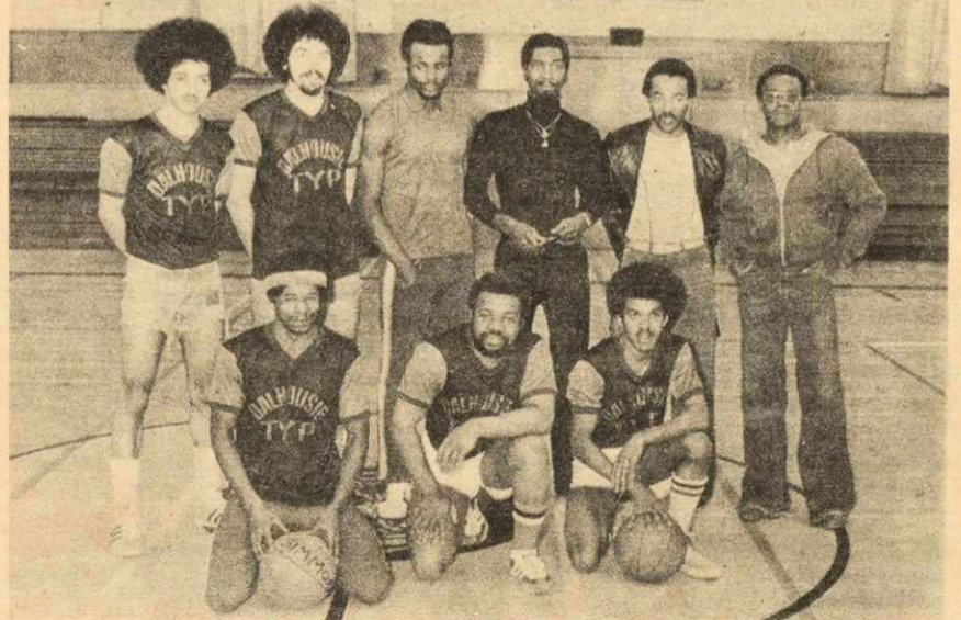
The Transition Year Program team won the Dal intramural "B" division basketball championships.