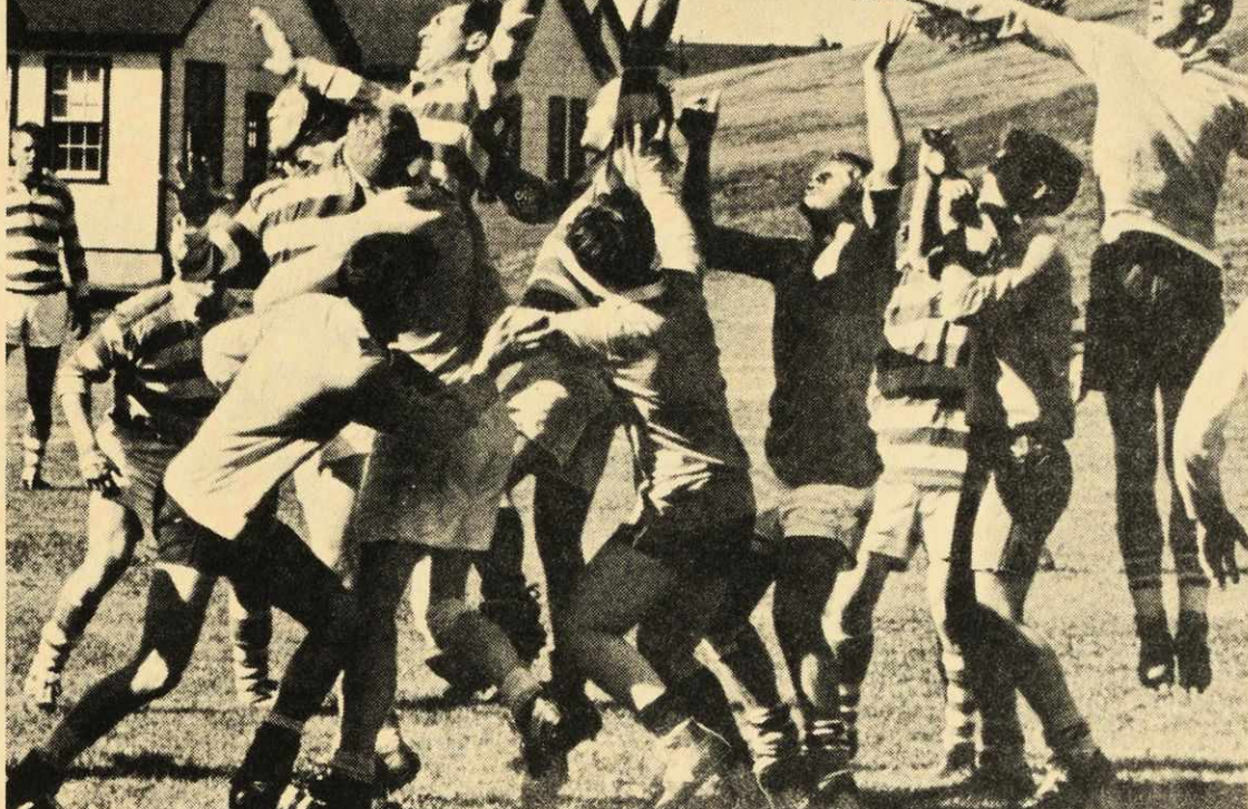
Dalhousie Rugby team showing the style that won them the Maritime championship