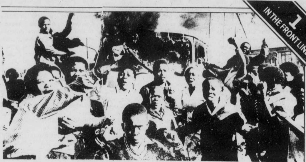
A truck blazes during a Black resurrection.