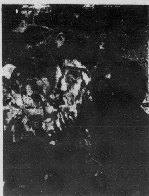
The latter is a frequent scene.