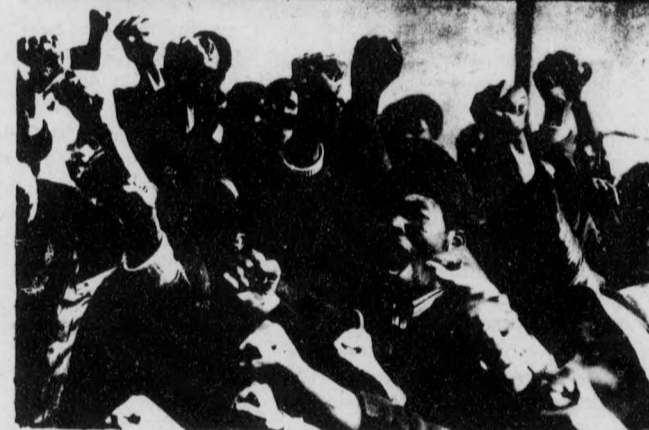
Mourning Steve Biko's death: died of natural causes in jail.

Amounting to only 17 percent of the population, the Whites have successfully protected Christianity and the value of Western morals and technology, as many Africaners will admit, and argue. They aren't so willing to admit how.