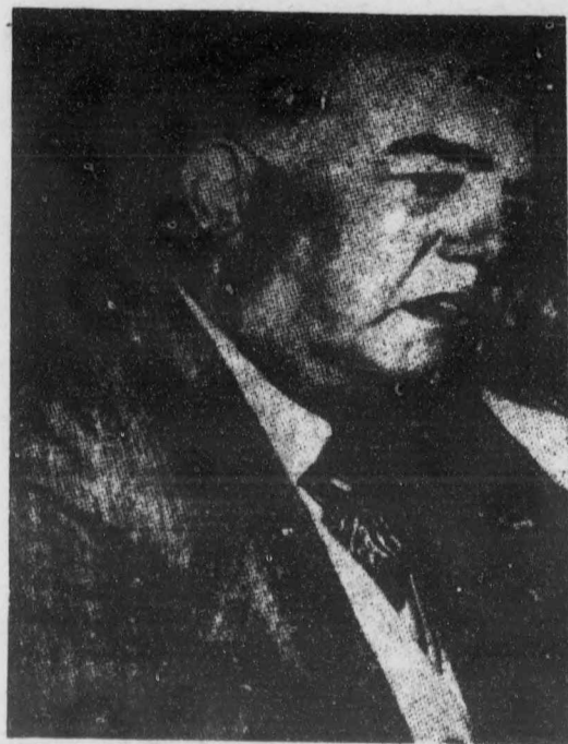
The head of South Africa (Vorster) and two of his following.