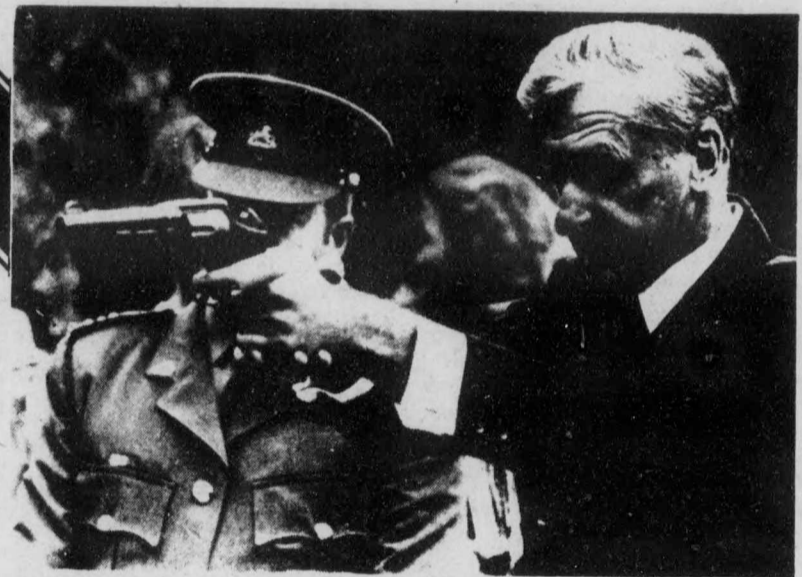
Smith gets polished up to keep 'law' in Zimbabwe.