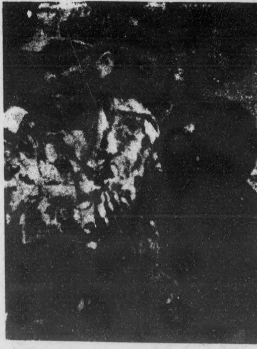
The head of South Africa The latter is a frequent scene.