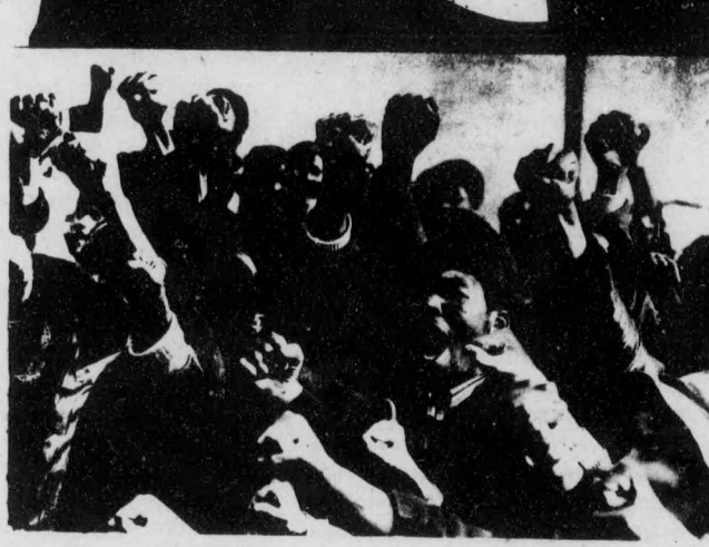
Mourning Steve Bikos death: died of natural causes in jail.