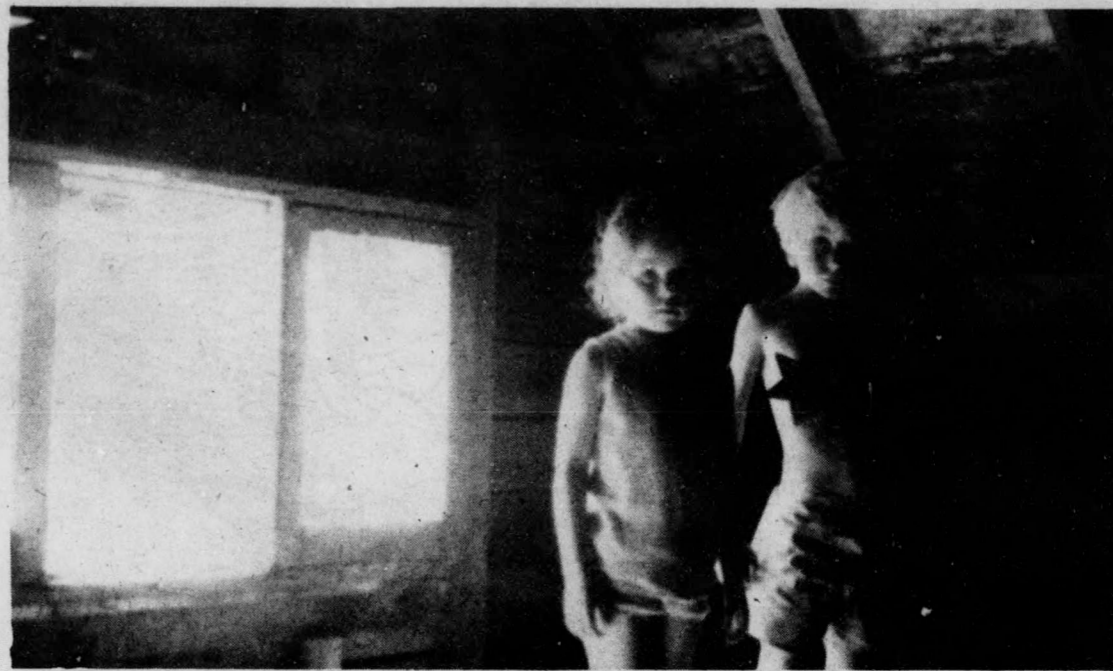
Photo of the Week was submitted by Gerry Pugh of Saint Thomas. Bring yours in next week.