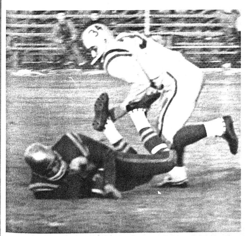
ANOTHER FIRST DOWN!