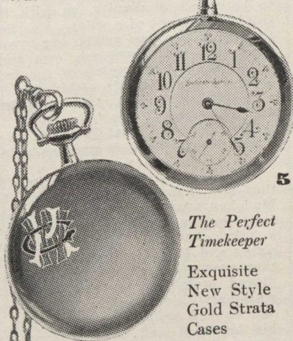
The Perfect Timekeeper