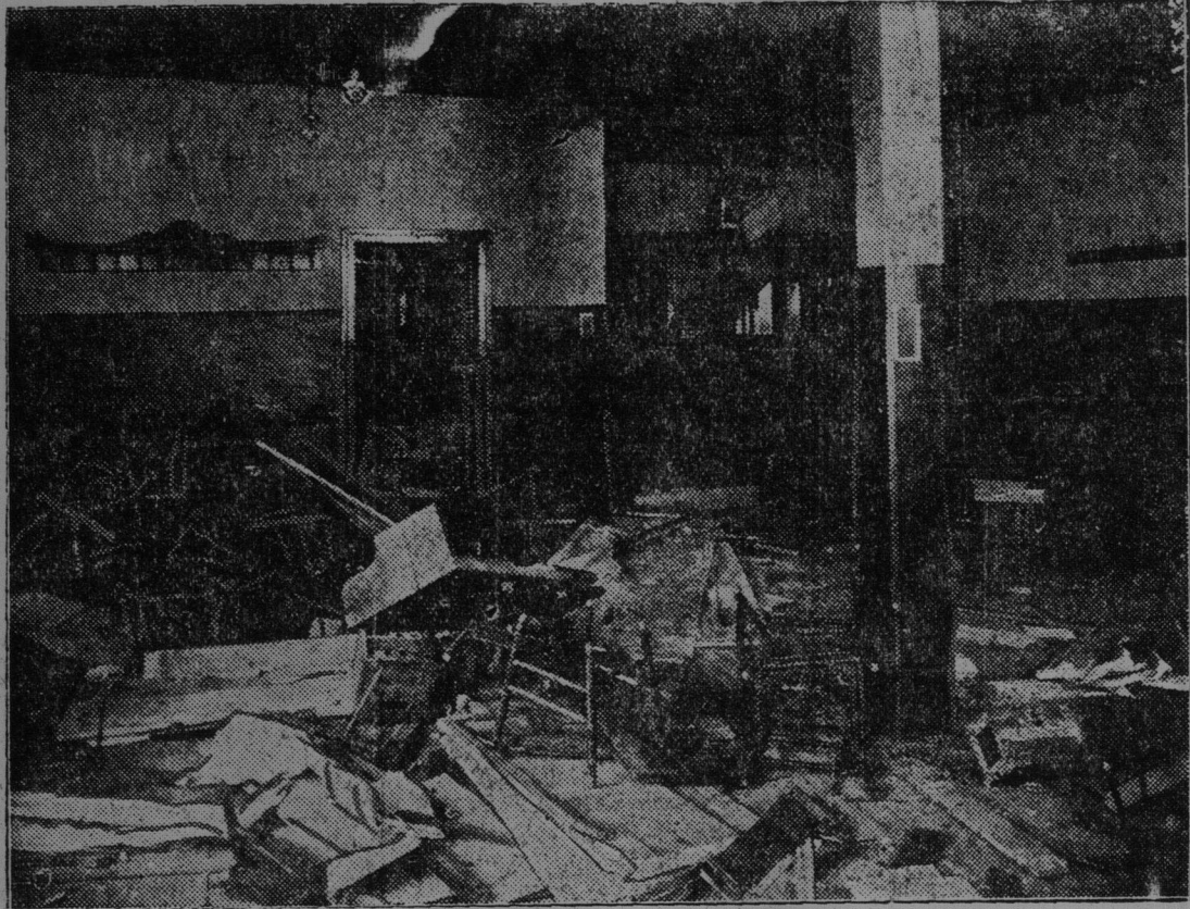
The interior of the German Club at Winnipeg, after returned soldiers had got through with it.

We Eat Too Much Meat Which Clogs Kidneys, Then the Back Hurts.