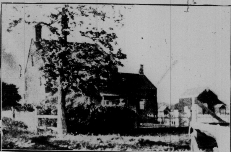
ANNUAL DINNER OF THE WHITMAN FELLOWSHIP. WHITMAN'S BIRTHPLACE, WEST HILLS, L. I.