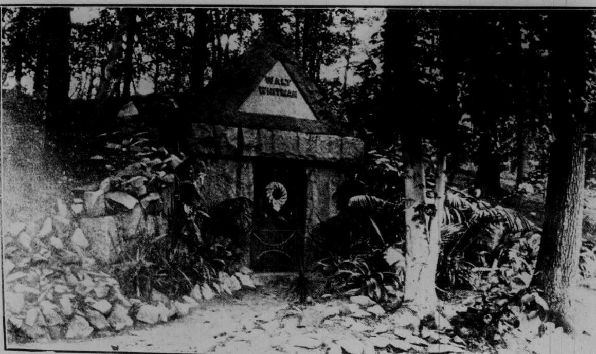
WHITMAN'S TOMB, CAMDEN, N. J.