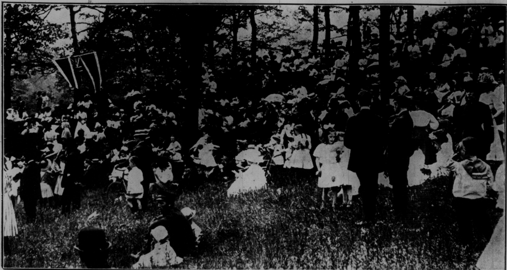
CORONATION DAY IN TORONTO—SOME OF THE CROWD LISTENING TO THE SALVATION ARMY SERVICE IN HIGH PARK.