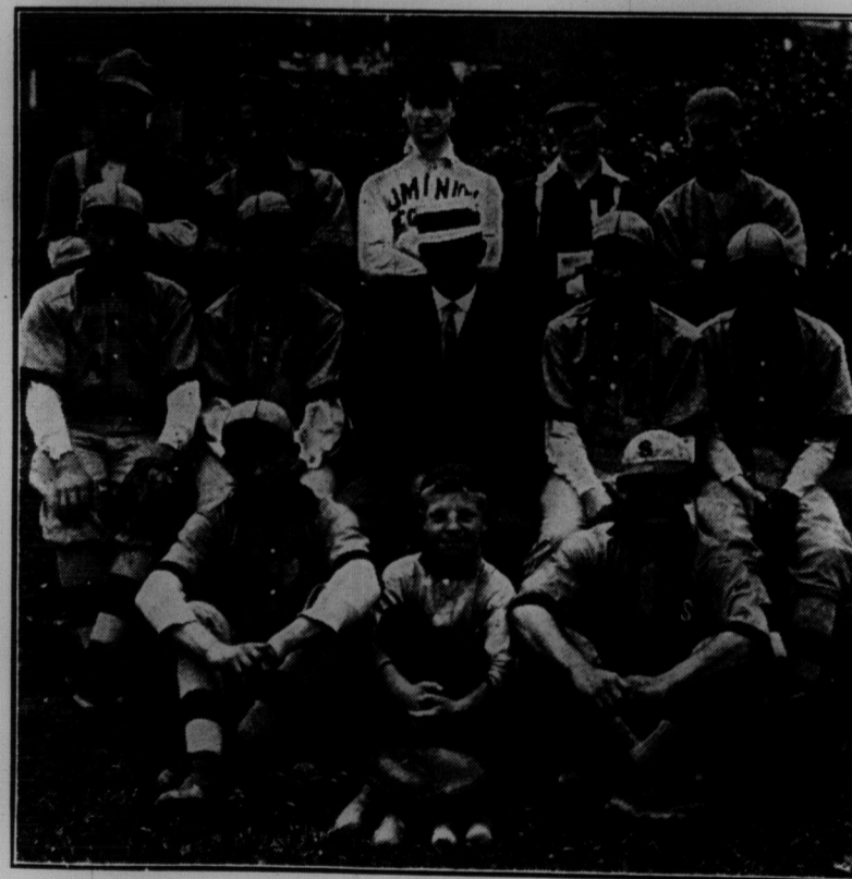
REGAL B. B. C. OF THE DOVERCOURT INTERMEDIATE LEAGUE.