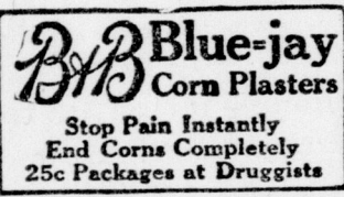
Blue-jay Corn Plasters Stop Pain Instantly End Corns Completely 25c Packages at Druggists

With dainty footwear, corns can hardly be avoided. But they matter little when you know the way to end them. As soon as a corn starts, attach a Blue-jay and forget it. The corn will never pain. In two days, if it is a new corn, it will disappear. Some times old corns need a second application. It is almost as simple as removing a dirt spot. Blue-jay is applied in a jiffy. It fits the toe like a glove. When you remove it—