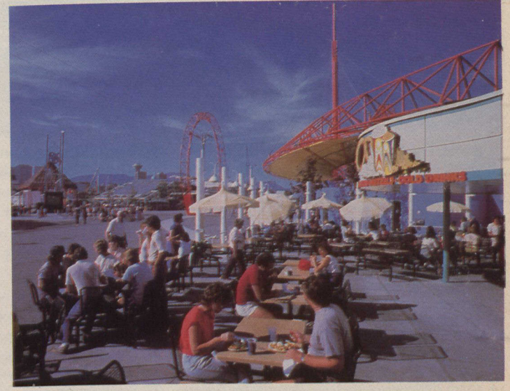
At some 70 sites, up to 14 000 people are served gourmet meals or quick cuisine by many international participants.