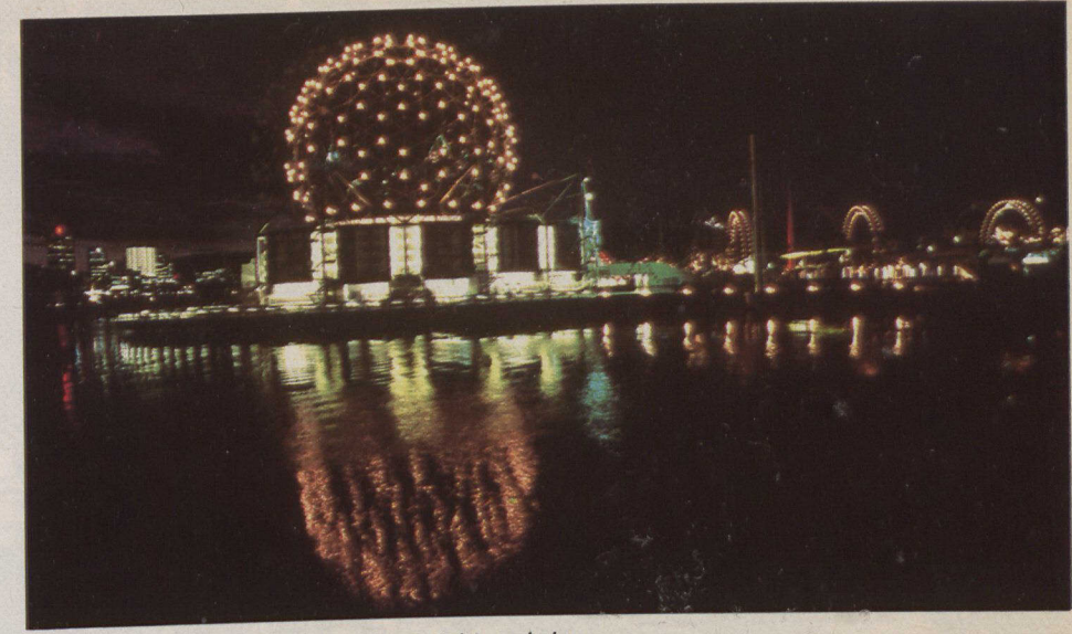
The EXPO Centre draws visitors night and day.

Entrance to pavilions All displays Some 14 000 performances Unlimited use of the monorail, cable skyways, ferries and the rapid transit system between the two sites.