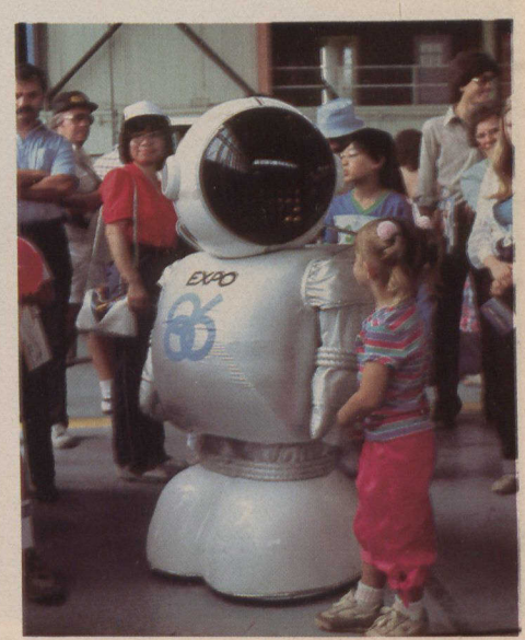
Expo Ernie, EXPO 86's mascot and robot ambassador, greets visitors to the exposition.

More than 130 Third World business and government representatives from more than 15 countries are taking part in the program, along with some 600 Canadian businesses, and trade and import/export organizations.