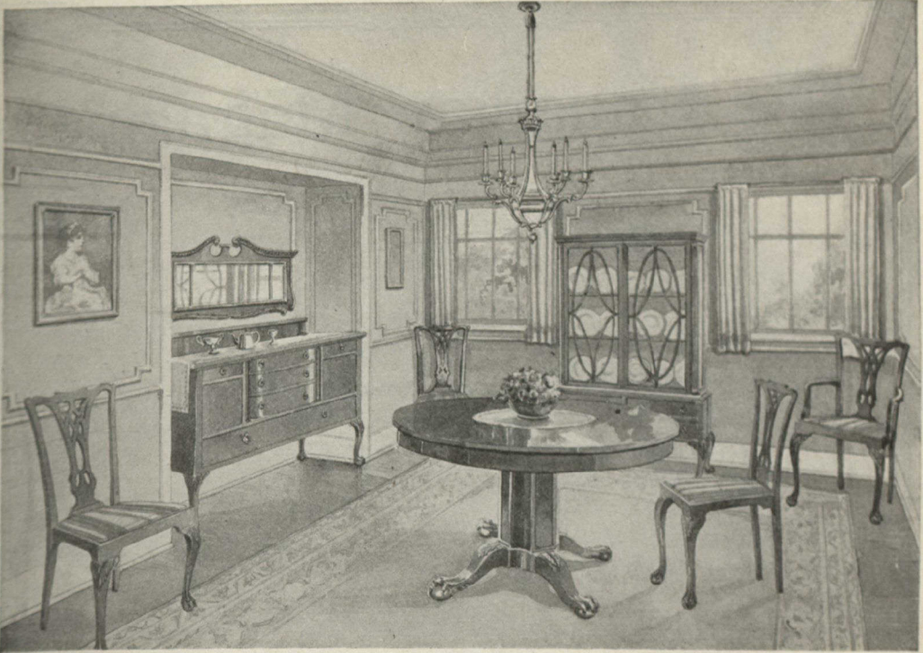
Walls, white or covered with foliage paper, with blue or grey predominating; woodwork white; rugs, plain dark blue centre with floral border; hangings dark blue; pictures, eighteenth century sporting prints or reproductions of Gainsborough, Reynolds or Romney.