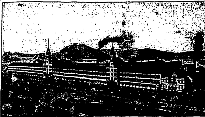
Factory of the American Watch Co.-Waltham, Mass.