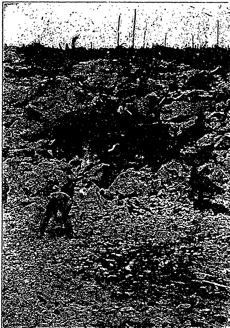
ORE QUARRY, SHOWING MASSIVE CHARACTER OF ORE.