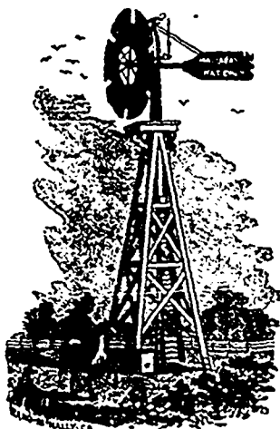
Halliday's Standard Wind Mills, 17 Sizes.

State what you want and send for Illustrated Catalogue.