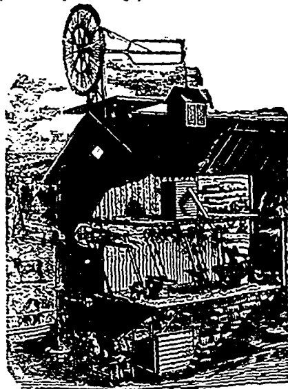
Geared Wind Mills, for Driving Machinery, Pumping Water, etc. From 1 to 40 horse power.