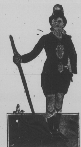
HARRY C. MYERS "A CONNECTICUT YANKEE" WILLIAM FOX PRODUCTIONS