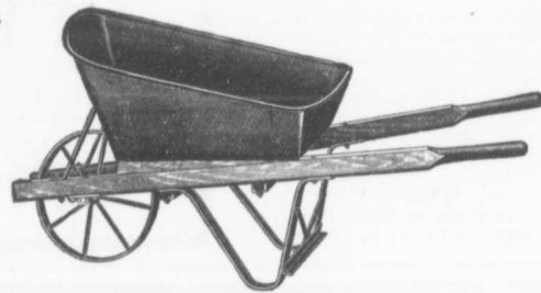
"STERLING" ROLLER BEARING CONCRETE BARROW NO. 10