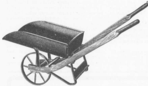
"STERLING" ROLLER BEARING CONCRETE BARROW—FOR- WARD DUMP