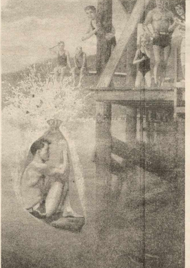
The Monte Cristo dive, featuring rocks, ropes, knives, scissors, deep water, what fun!

(104) Monte Cristo Sack Dive (Cf. frontispiece) is executed by tying a man in a large gunny sack, weighted with stones. If a canvas sack is used, some holes must be cut in it to permit water to enter the sack, otherwise the water pressure will close the sack so tightly that the subject inside may not be able to force the bag open. A string is laced around the top but a loop is pulled into the bag and cut. The subject holds these loose ends as he climbs into the bag. An impression is given of tying the bag very tightly by tying several knots, one over the other. The sack is thrown overboard by assistants, who await with open knives or scissors to see if the subject can get out. The subject allows the bag to settle at the bottom in six to ten feet of water, then forces the bag open and comes out of the bag and to the surface. (It is always wise to have lifeguards ready in this stunt and if the subject is not out in thirty seconds, they should go down and bring the bag and victim up to the surface, then cut a hole quickly near the face. This part should always be practiced in advance.)