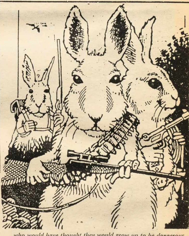
... who would have thought they would grow up to be dangerous revolutionaries?

The Gazette wishes to promote the use of the newly established unclassifieds. An unclassified is a non-commercial notice. Three lines are free (approx. 20 words). Additional words will cost a phenomenal 20¢ each.