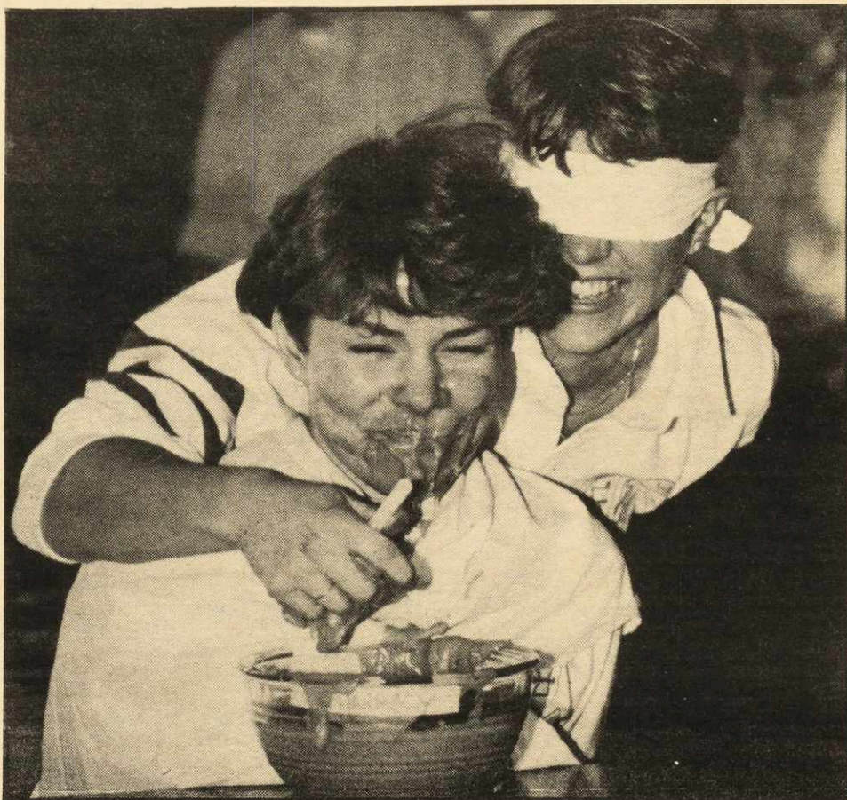
Mysterious eating contest.