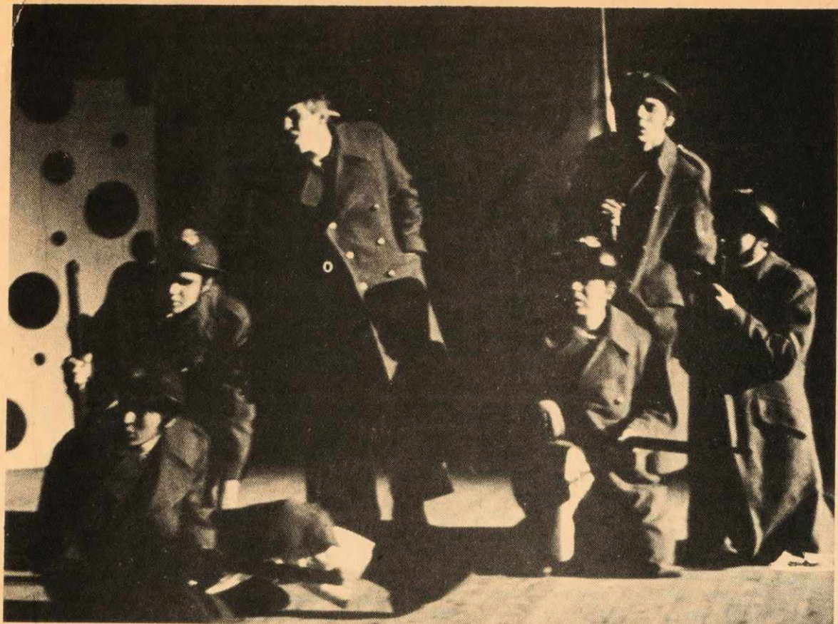
Six British soldiers celebrate Christmas, 1914, in the trenches, in this scene from the DGDS presentation "Oh, what a Lovely War".