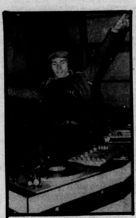
Saturday Nite Live

And no wonder, when one considers that the pages of his letter contained within them some rather spicey details