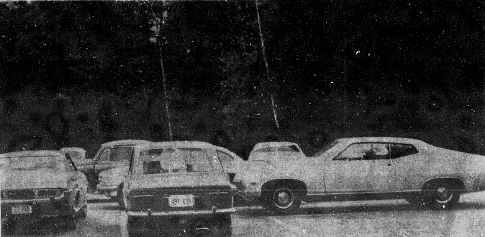
These trees won't exist very shortly. This is where the new parking lot will be