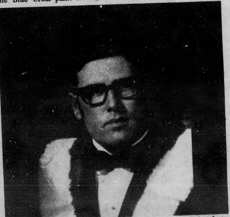
The Yearbook staff would like to connect a name with the photo of this graduate. Please contact their office if you know who this is (or you are).

The Constitution Committee has added five seats to the SRC. Thus, when the constitution is approved on March 18, there will still be