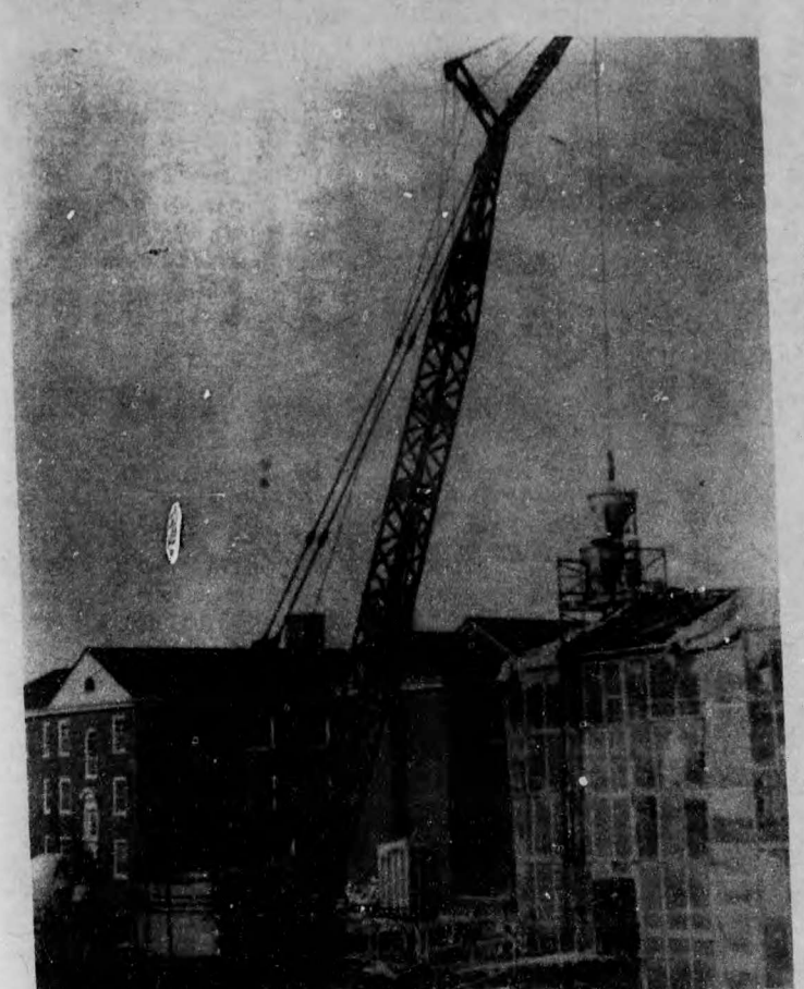
LDH expansion will raise to 400 the number of co-eds living in the complex. See next week's Bruns for a report on residence housing and the student housing committee.