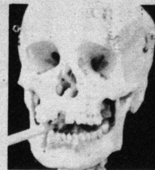
Before Ultima treatment