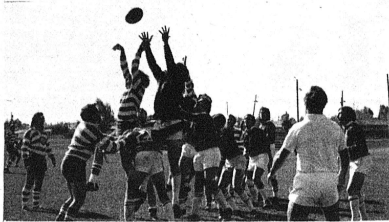
The game of rugby has been the forerunner of most of the football codes played in the