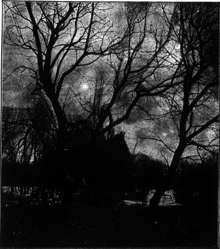
Going to School in a Manitoba Country District

So he went to the forest and sat him down by the side of a still, clear pool. All day long in its sunlit depths the little fishes darted hither and thither, while over its calm surface the waterflies skimmed, light as air. All day long the sunshine lay warm and bright above it. Sometimes a warm little wind wandered idly across it, and then the sunbeams danced, oh, so brightly, on the tops of the tiny wavelets. All day long on the fragrant air fell the wild music of birds, while