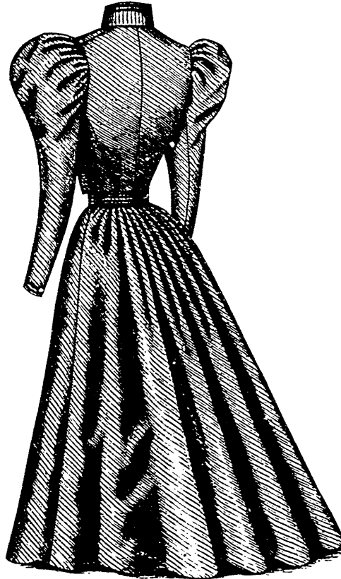
1471 Side-Back View.

lining and are turned under at their upper edges and gathered to form a frill heading, and the fulness is drawn well to the center at the waist in shirrings that are tacked to the lining. Above the full portions the lining is faced in yoke effect, and below the shirrings the wrapper falls in soft folds. Long under-arm darts give a smooth effect at the sides. The neck may be finished with a high standing collar or with a turn-down collar having flaring ends. The sleeves are shaped by inside and outside seams and are made over coat-shaped lin-