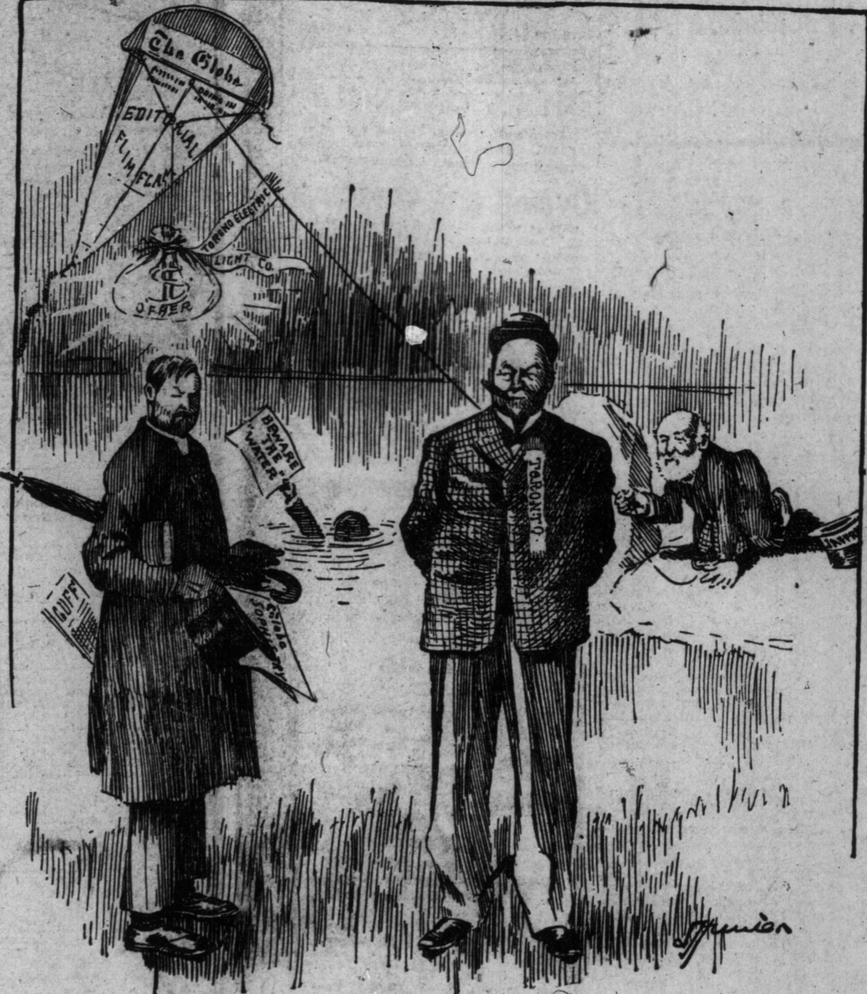
BUT THEY CAN'T INDUCE MR. TORONTO TO GO IN FOR IT.

CASSIE CHADWICK LEFT SIX BANK PASS-BOOKS Apparently Had $305,000 in Second Pittsburg National, But Not for Relatives.