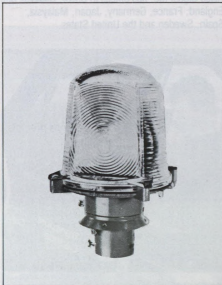
◀ High intensity runway lights