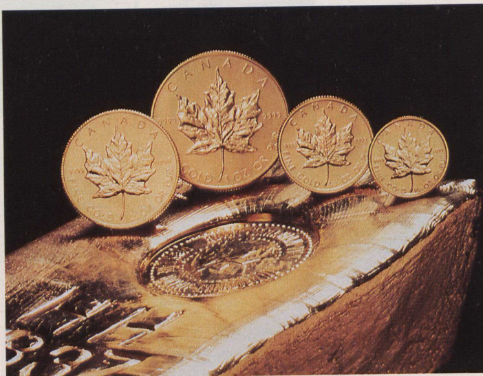
The Royal Canadian Mint has sold more than 8 million ounces of the Gold Maple Leaf coins since they were introduced in 1979.