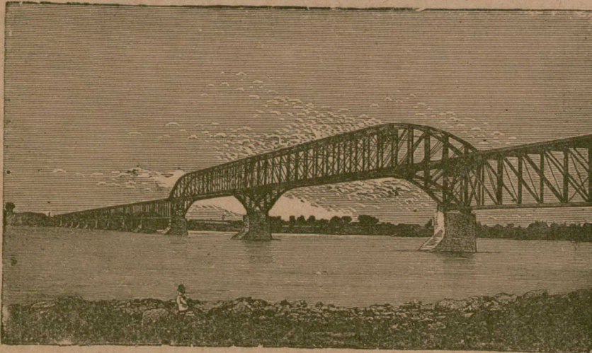
ST. LAWRENCE RIVER BRIDGE, CANADIAN PACIFIC RAILWAY, LACHINE, P. Q.

The cost of Metal Bridges for a term of years, is less than the cost of building repairing and replacing wooden bridges, and believing the only reason so many bridges are still built of wood to be that those who are charged with the duty of contracting for them are not aware how little difference there really is in the first cost of a good Iron or Steel Bridge and a well-built wooden one, of equal strength, we are at all times pleased for an opportunity to quote prices to officers of counties, cities and townships, so that they may intelligently compare the cost of metal and wooden bridges. To enable us to name prices closely we need information on the following points: Number of spans and length of each span. Width of roadway and number and width of footways and sidewalks. Kind of Lumber to be used for floor joists and plank and its value. Name of nearest R. R. Station and distance of bridge site from station. Depth of water at ordinary level and height of floor above water. Also strength and capacity of bridge required, if any particular strength has been determined on; or a general statement as to the nature of travel over the bridge; whether on a country road, a well-ballasted turnpike, or located in a village or city, and subject to heavy loads.