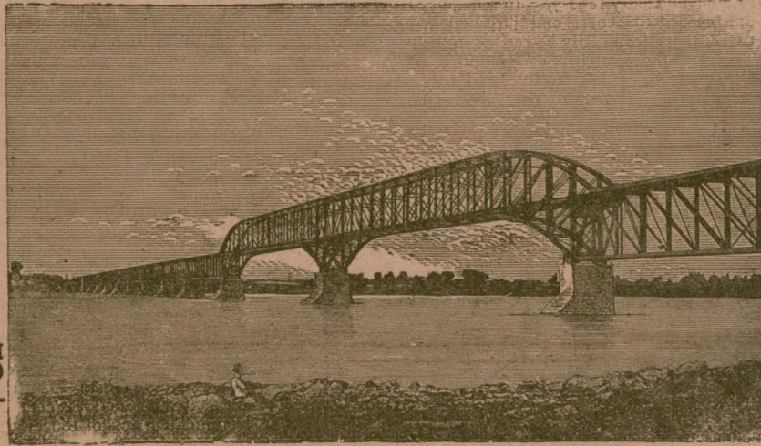
ST. LAWRENCE RIVER BRIDGE, CANADIAN PACIFIC RAILWAY, LACHINE, P. Q.

For Railways and Highways, Iron Bridges, Turntables Iron Piers and Trestles Bridge Rods Right and Left Hand Sleeve Nuts and all kinds of Structural Iron Work.