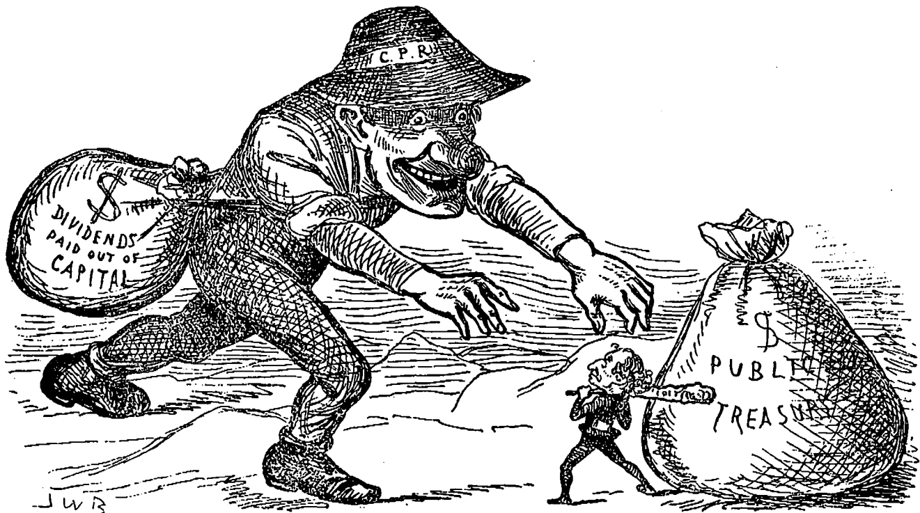
JACK AND THE GIANT ONCE MORE.

furniture went swimming round me—but I recovered when I got into the fresh air. My landlady!—I dared not think of her. I was in the blackness of darkness of despair, when suddenly an idea dawned upon me like a star through a rift in the clouds. Rushing home I entered the house, whistling loudly for the edification of my landlady, and gathering together several scraps of wit and humor, the products of my leisure moments, I studied them in the crown of my hat—and making a bee-line for Front-street entered GRIP office. The bird received me cordially—but gave me an electric shock by saying: "I see you would like to be paid for these in advance?" I tried to protest, but his eye was upon me. He knew all, I could see; what he don't know isn't worth knowing, and going to a drawer he took therefrom a V. bill, and I was saved. Paid my landlady and laundress. Temperature high—sudden thaw—air soft and mild.