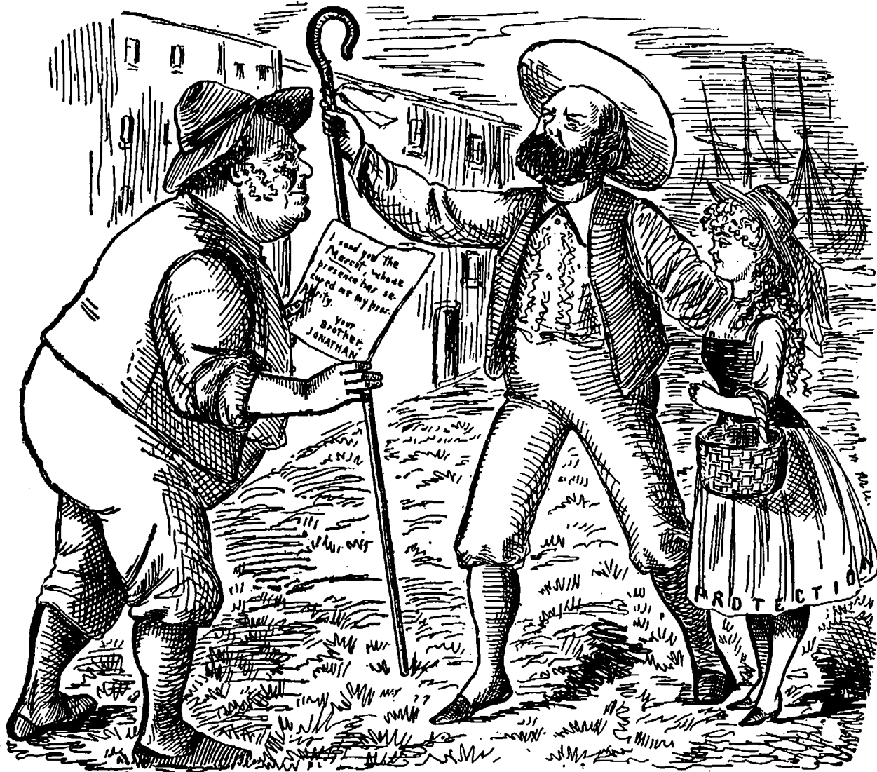
SCENE FROM THE POLITICAL "MASCOT."

Rocco, MR. JOHN BULL. Pippo, MR. LORD SALISBURY. Bettina (the charmed Mascot), MISS PROTECTION.