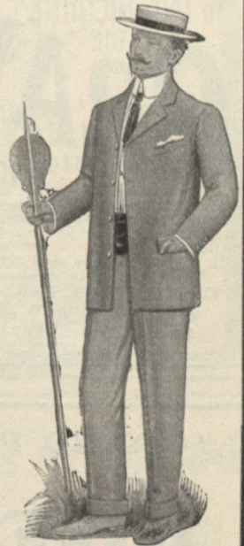
Coat and Trousers.] No. 10A. From $6.85.

Ladies' Costumes from $6.40; Skirts from $2.50; Girls' Dresses from $2.20; Gentlemen's Suits from $8.55; and Boys' Suits from $2.60, to measure.