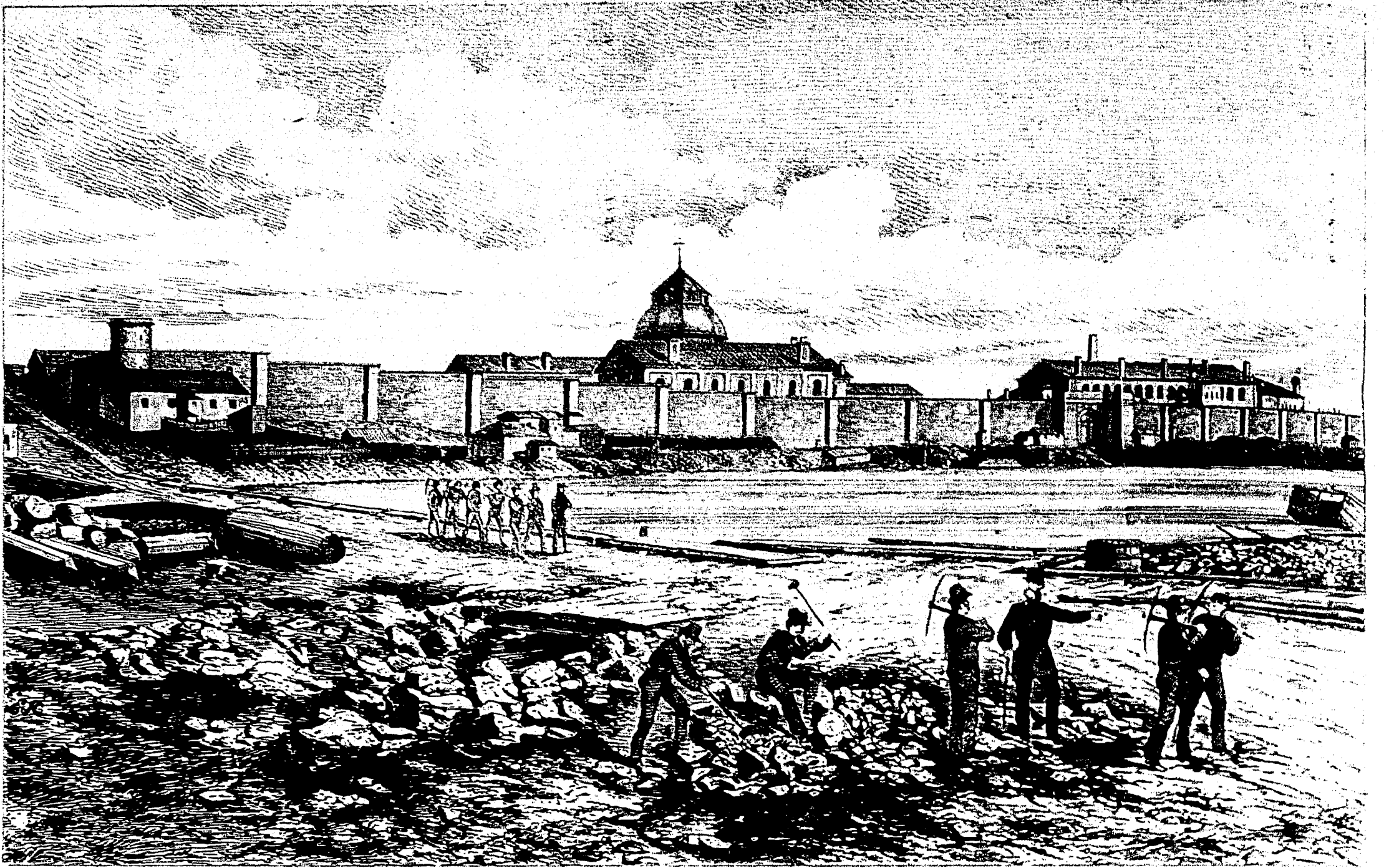
THE PROVINCIAL PENITENTIARY, KINGSTON.