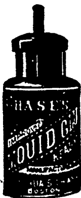
The Brown Bros., Ltd.