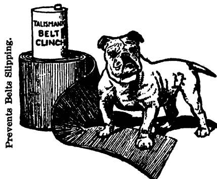
Prevents Belts Slipping.