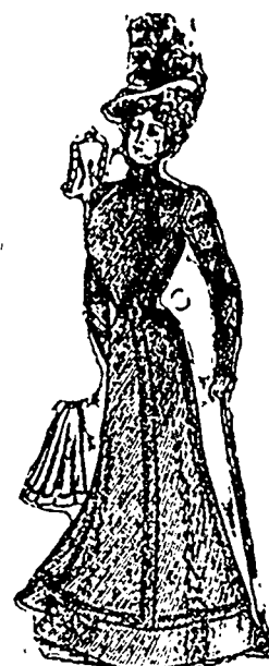
7723—Ladies' Waist. 7795—Ladies' Circular Skirt with Tunic. Waist, 32, 34, 36, 38, 40 inch bust. Skirt, 22, 24, 26, 28 and 30 inch waist.