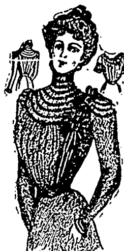
7808—Ladies' Round Yoke Waist. 32, 34, 36, 38 and 40 inch bust