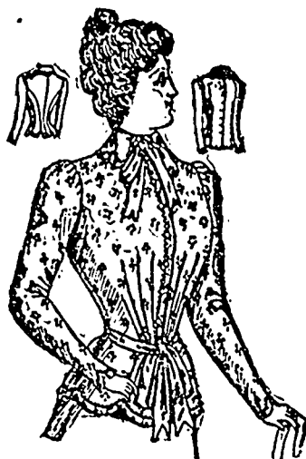
7815—Ladies' Morning Jacket. 32, 34, 36, 38, 40, 42, 44 inch bust.