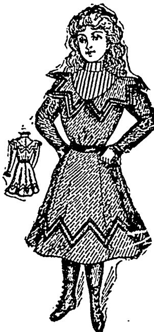
7821—Girls' Costume. 6, 8, 10 and 12 years.