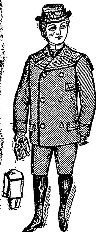
7566—Boy's Suit. 4, 6, 8, 10 and 12 years.