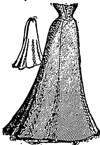
7785—Ladies' Three Piece Skirt without Fullness at Top. 22, 24, 26, 28 and 30 inch waist.