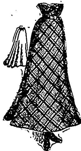
7818—Misses' Circular Skirt. 12, 14 and 16 years.