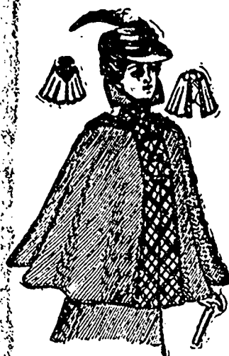
7822—Ladies' Golf Cape with Revers. 34, 38 and 42 inch bust

THE PHELPS PUBLISHING CO., Springfield, Mass., or Chicago, Ill.