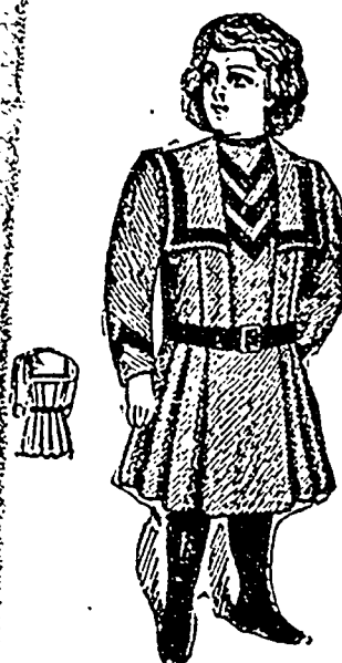
7606—Boys' Kilt Costume. 2 and 4 years.