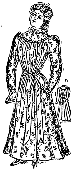
7824—Misses' Wrapper. 12, 14 and 16 years.