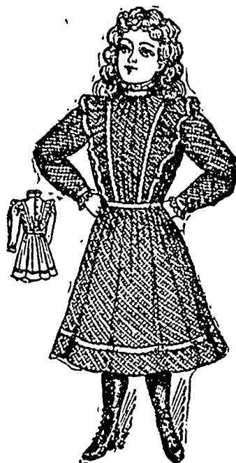
7771—Girls' Dress. 4, 6, 8, 10 and 12 years.