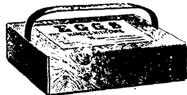
READY FOR SHIPPING.