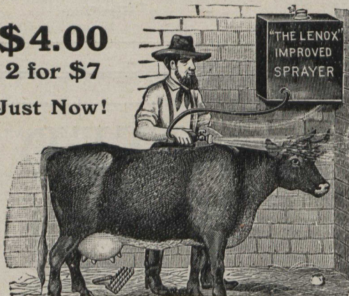
BETTER MILK AND MORE OF IT