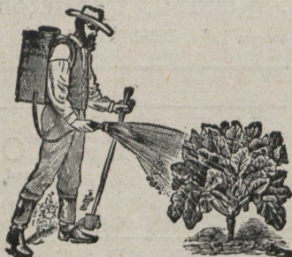
NO STOPPING TO PUMP AIR