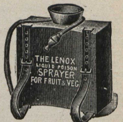
NO AIR PUMPING

Because we are overstocked you get it for this price.