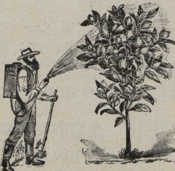
PRESS THE BULB, THAT'S ALL

LOTS OF TIMES you can use a knapsack sprayer in places where you can not a barrel pump. While talking or hitching up the horses the work is done. Handy at any place. Even if you have a barrel pump you will use this one anyhow. Lots of times a patch off yonder ought to be sprayed, but won't pay to hitch up the horses. If this machine is handy John will sling it on his back and the spraying will be done while you are thinking. Send for our circular. YOU SHOULD KNOW ALL ABOUT IT. Or perfectly safe to send for the sprayer direct without waiting for the circular. A small can "Sure Destruction to San Jose Scale" sent free with each sprayer, if ordered at once.