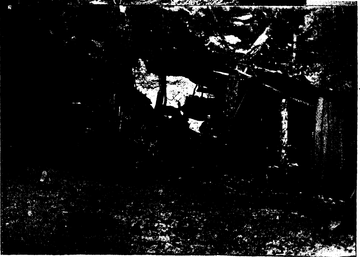
1. The Bunk House at the Dorothea Morton. 2. Upper Tunnel.

ploration Syndicate Ltd., on the 18th July, 1897, and is now owned by them. Work was at once started, and has been continued up to date. Besides the Dorothea Morton, the syndicate own adjoining and on the extension fourteen claims. About 1,200 feet of driving has been done, and the mine is opened up by a cross-cut tunnel,