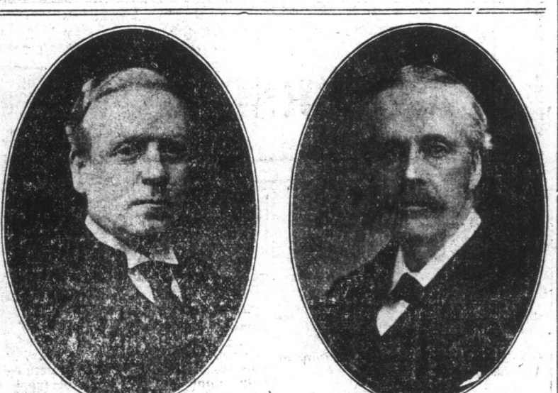
RT. HON. H. H. ASQUITH, Premier and Leader of the Government.

dum proposal of the latter. We cite the Resolutions moved last week in the House of Lords by Lord Lansdowne and passed without a division. It is desirable that provision be made for settling differences that may arise between the House of Commons and this House as reconstituted, reduced in number in accordance with the recent resolutions of this House. That as to bills, other than money bills, such provisions should be made on the following lines: If a difference arises between the houses in regard to any bill, other than a money bill, in two successive sessions and during an interval of less than one year, and such differences are unable to be adjusted by other means, it shall be settled at a joint sitting composed of the members of the two houses, provided that if the measure relates to a matter of great gravity, and has not been adequately submitted to the judgment of the people, it shall not be referred to a joint sitting, but submitted for decision to the electors by a referendum. That as to money bills, the provision should be on the following lines: The Lords are prepared to forego their