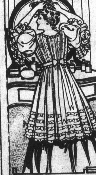
EMPIRE DRESSING JACKET.

The shirt waists and blouses are unusually becoming this winter, and one comforting fact—the styles are all so varied that nobody has an excuse for wearing an unbecoming garment.